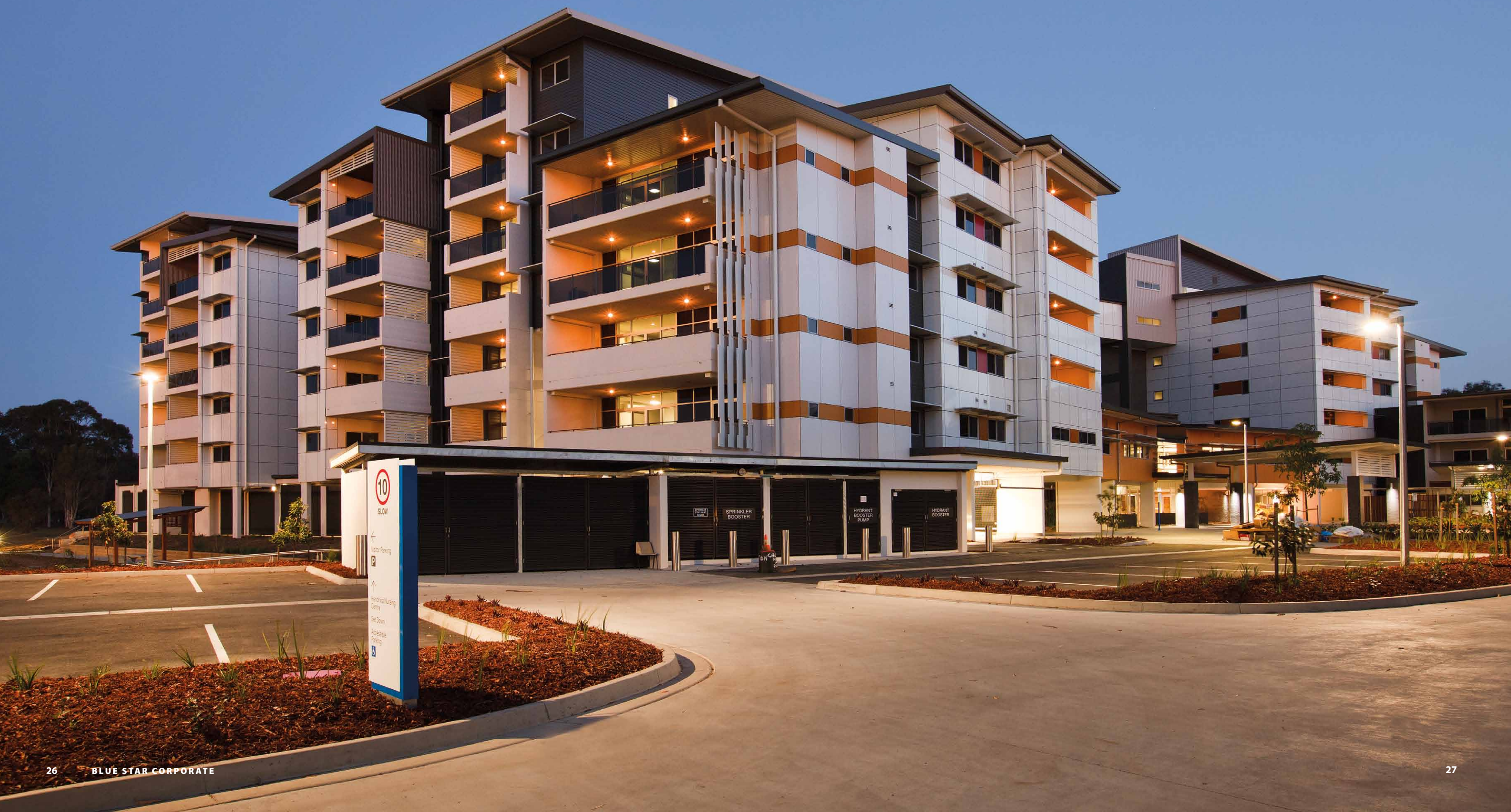
HOLY SPIRIT AGED CARE FACILITY Watpac Constructions Boondall, QLD